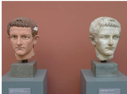
Greek statues were painted in living color!