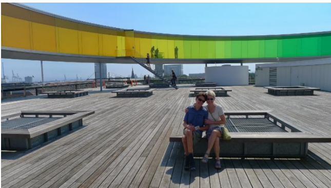
Your Rainbow Panorama on the roof of the ARoS Kunstmuseum in Aarhus