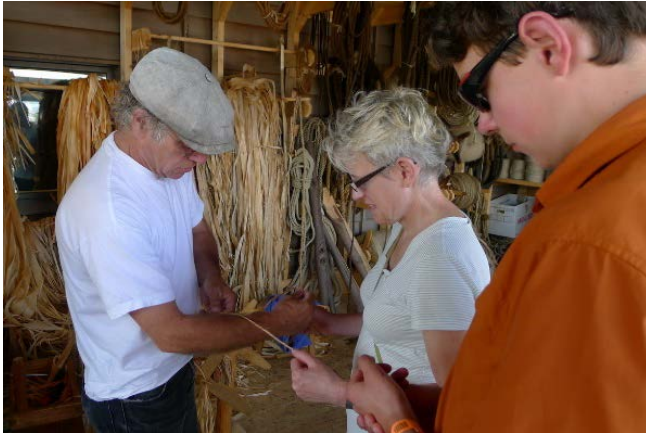
Making rope at the Viking Ship Museum