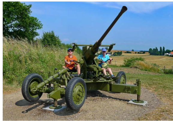
Trying out an anti-aircraft gun