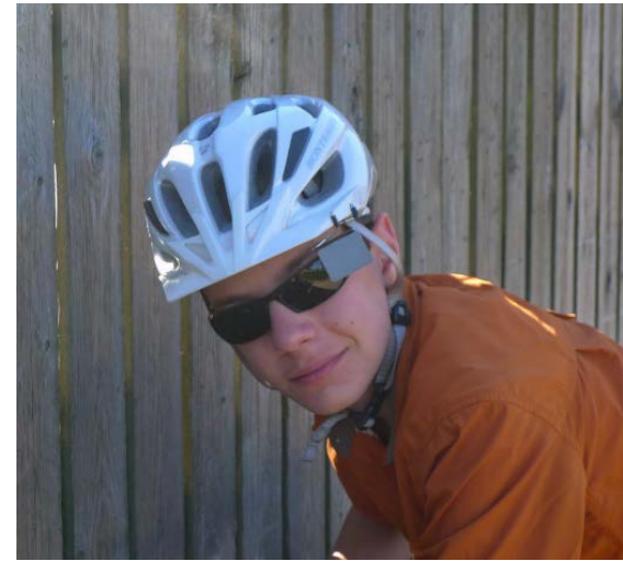
Check out the rear-view mirror on the helmet

Our goal this year was to take a leisurely ride around Denmark. Even though it is a relatively flat country, it seemed as if we did a lot of climbing, so our legs were toasted by the end of our 460 mile tour. We started in Copenhagen, riding south to Mons Klint, then west through Lolland, down to the Koldkrigsmuseum on Langeland, then through Faeborg to the DanFos Universe on Als. Then north to Aarhus, east to Ebeltoft to ferry across to Sjælland's Odde and back to Copenhagen.