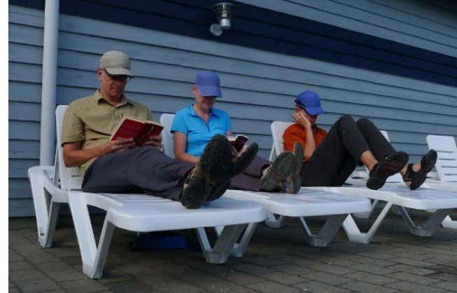
Too cold to swim in the pool, so we read instead