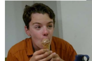
A final, well-deserved ice cream