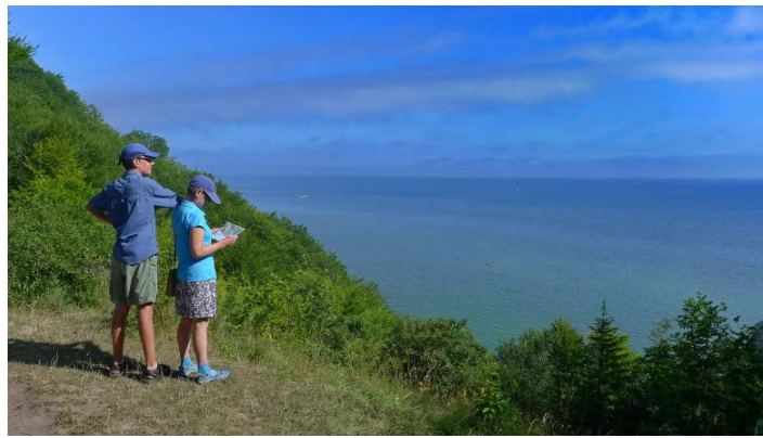
Beautiful view of the Baltic Sea