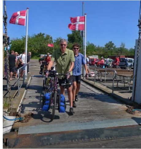
Rolling onto another ferry