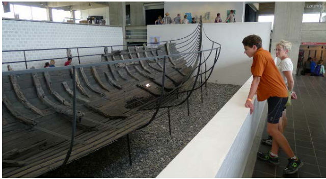
Reconstruction at the Viking Ship Museum in Roskilde