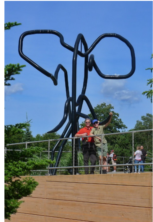
Elephant sculpture at Copenhagen Zoo