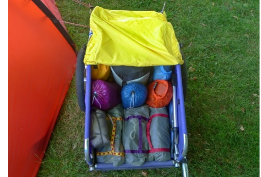
It's not easy being this neat