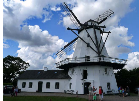
We got lucky and toured a restored windmill open for school tours once each month