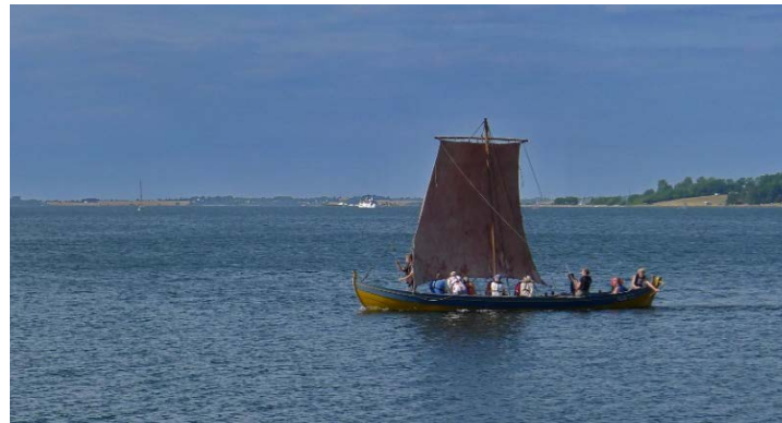
Sailing a traditional Nordic boat on Roskilde fjorde