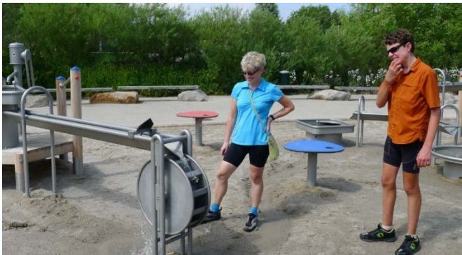
Part of a larger hydro-power children's exhibit