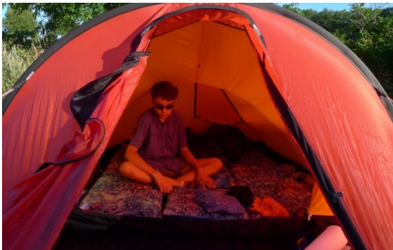
We look forward to spending 3 weeks in our tent