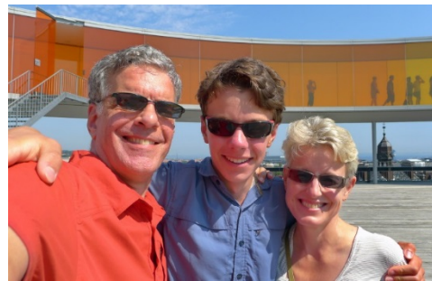
Family photo on the ARoS roof