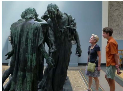
At the National Gallery of Denmark