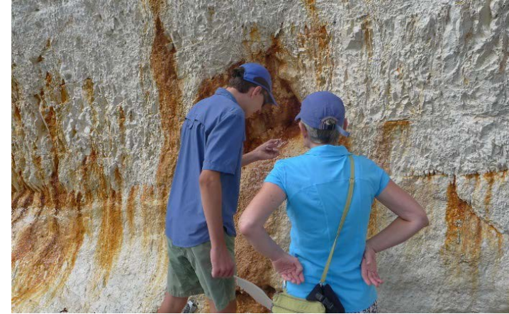
Rust staining in the gypsum cliff at Møns Klint