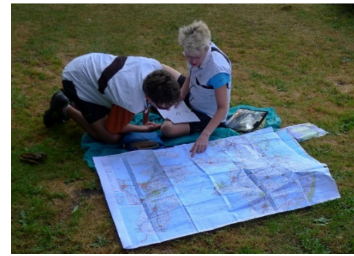
Map check at a lunch stop