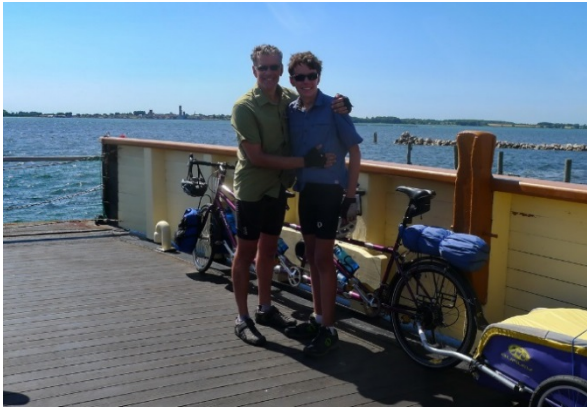
On the ferry from Bogø to Stubbekøbing