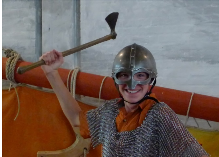
Dressed for the part, but no killer instinct