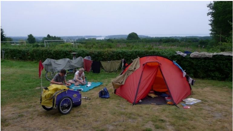
We sometimes prefer the gypsy look at our tent sites