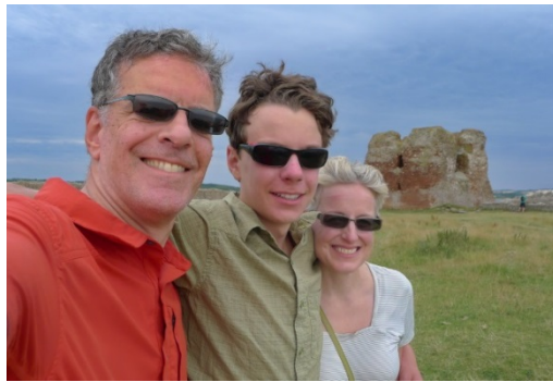
At the Kalo Slotsruin near Aarhus