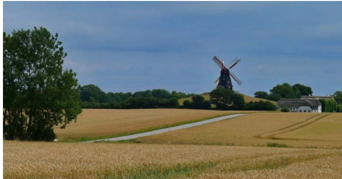
We didn't see as many old windmills as we expected