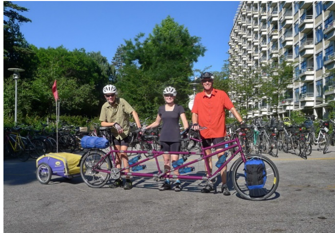
Starting at our Airbnb apartment in Copenhagen