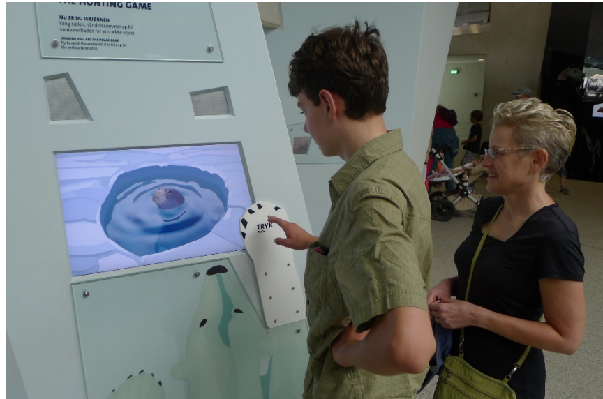
A "kill the seal" game at the zoo