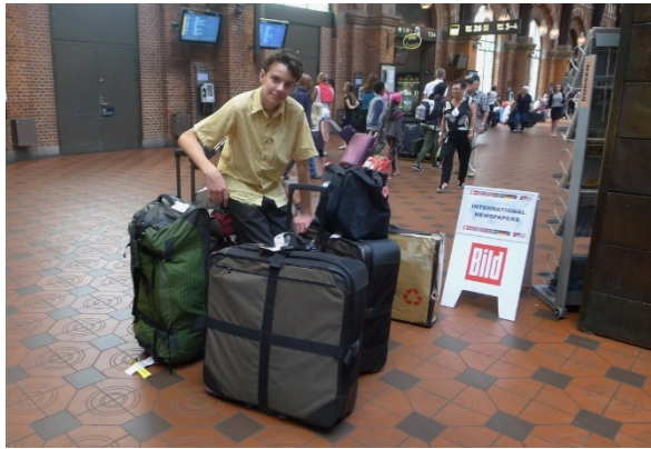
Arriving at the train station in Copenhagen