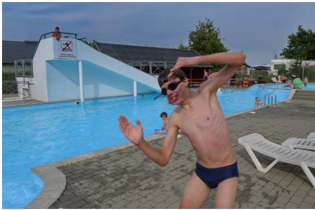
Warm enough for some pool time