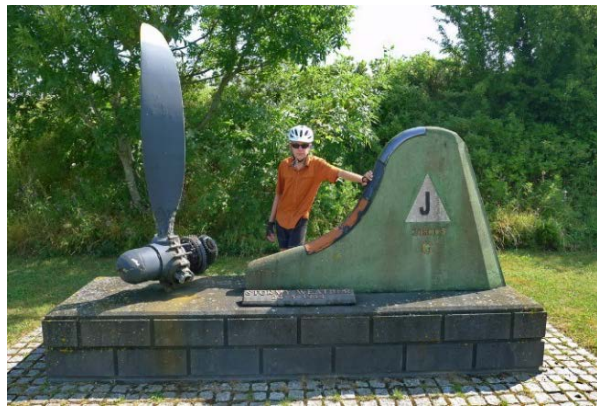
Memorial for a shot down WWII bomber