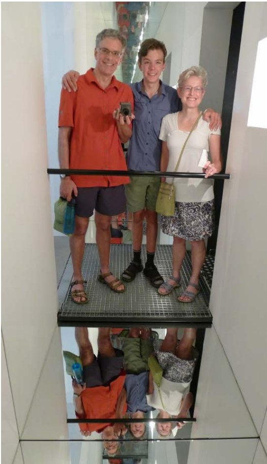
Mirror exhibit at ARoS Kunstmuseum