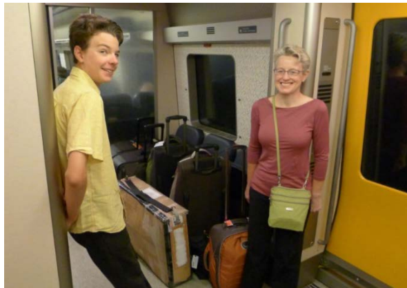
Heading to the airport on the train