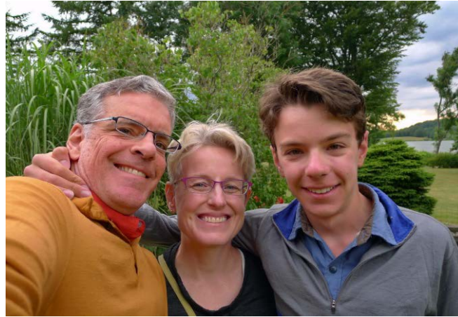
Halfway through the tour and still smiling