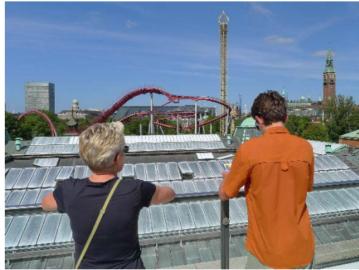
Looking toward Tivoli Gardens