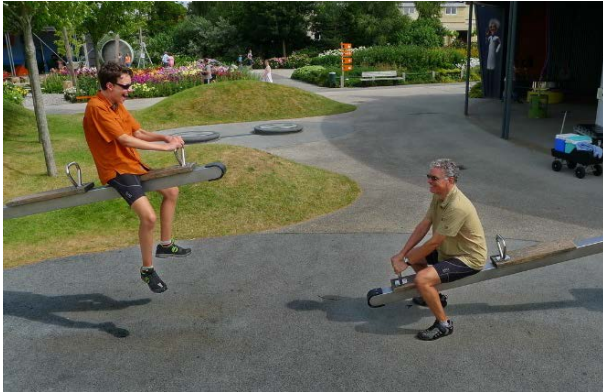
Unusual hydraulic teeter-totter