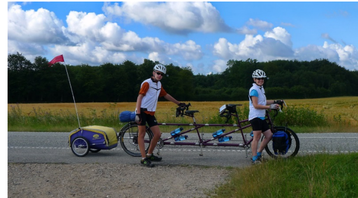
Sunshine on the road to Aarhus