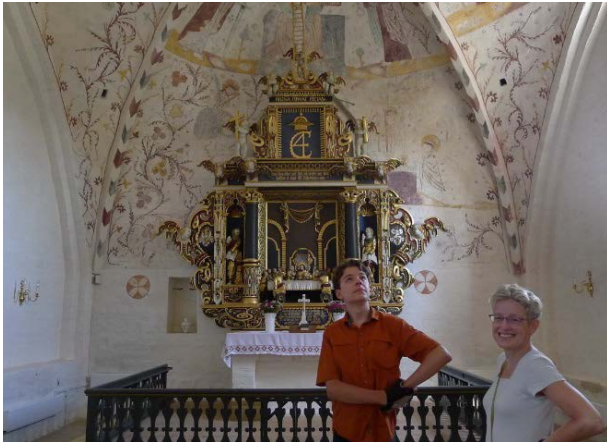
Elmelunde Kirke on Møn was built in 1075