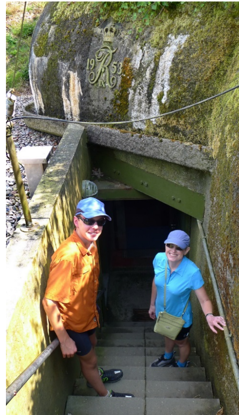
Entrance to an underground control room at the Cold War Museum at Stevnstort