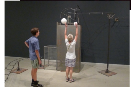
At the ARoS Kunstmuseum in Aarhus