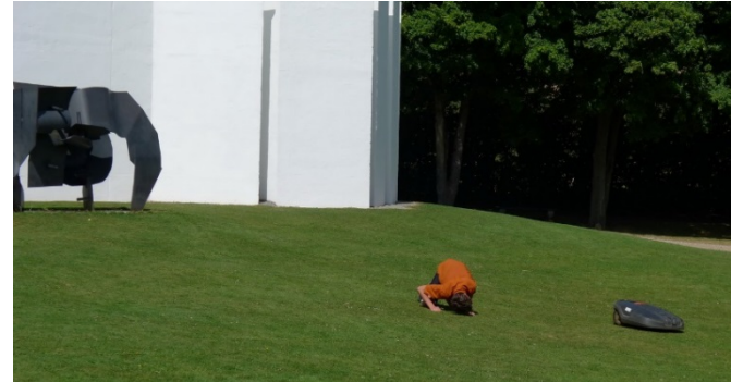
Checking out the electric mower at the Trapholt Museum