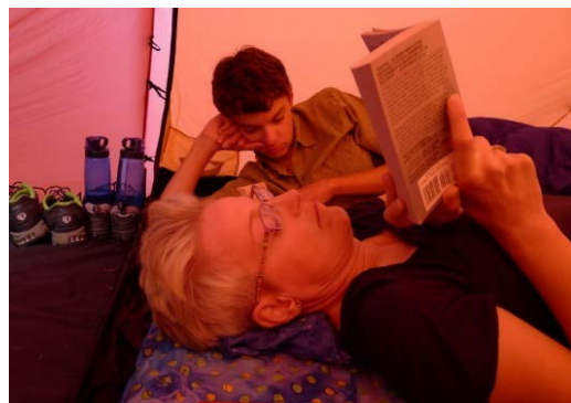
We carried a dozen books on the trip