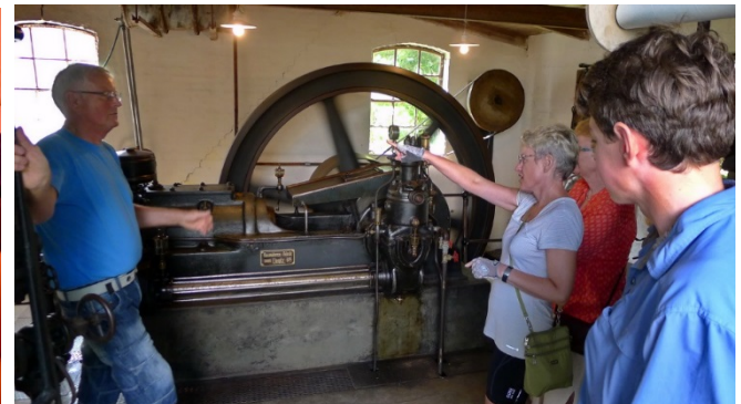
The generator room for the restored windmill