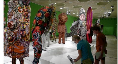
Nick Cave's Soundsuits at Trapholt