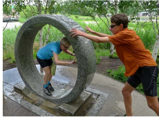
Granite wheel rotates on water