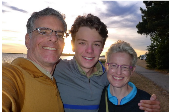
Our last campground near Roskilde