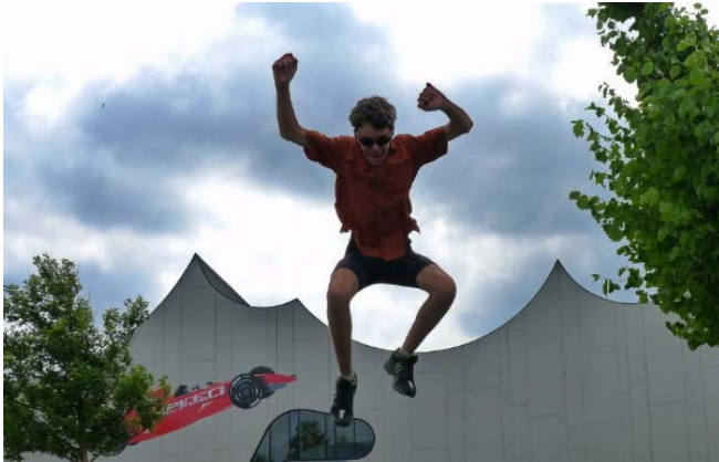
Jumping for joy at the Danfoss Museum in Nordburg