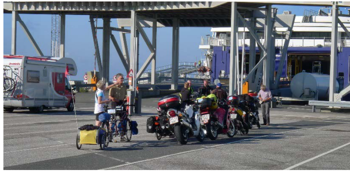
Waiting to board the ferry from Ebeltoft to Sjællands Odde